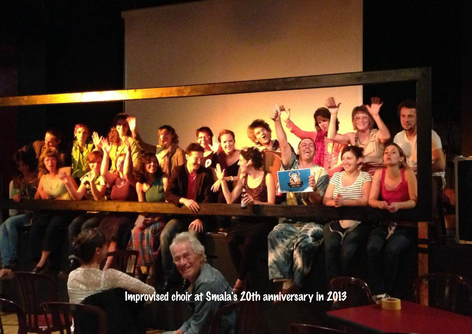
Improvised choir at Smala's 20th anniversary in 2013